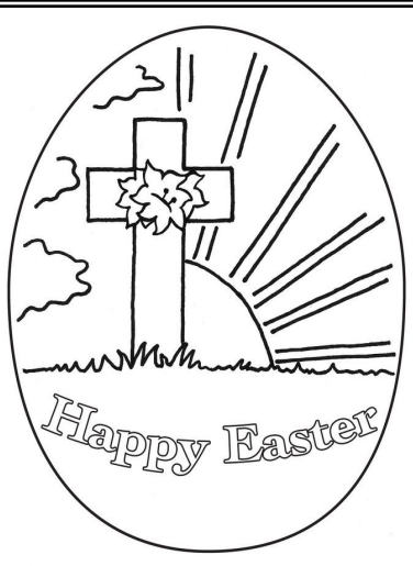
East Glenville Community Church

Thursday, April 14, Maundy Thursday at 7pm