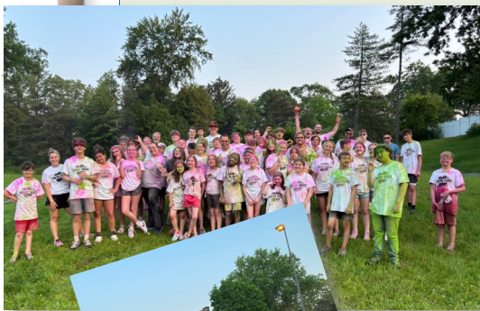
Color Wars 2025