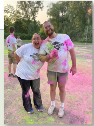
Color Wars 2025

With Youth Group, Bible Study and Sunday School coming to a close, we can only say that we as a team are quite content with how this academic year went by. We were able to survey the students, and we received great input on what they were able to learn and experience; it was unanimous that they were able to understand the Word more deeply, grow closer to the Lord, and learn more about their faith. We are so glad that things went the way they did, and we are very excited to make some adjustments to make things smoother and more impactful than they already are.